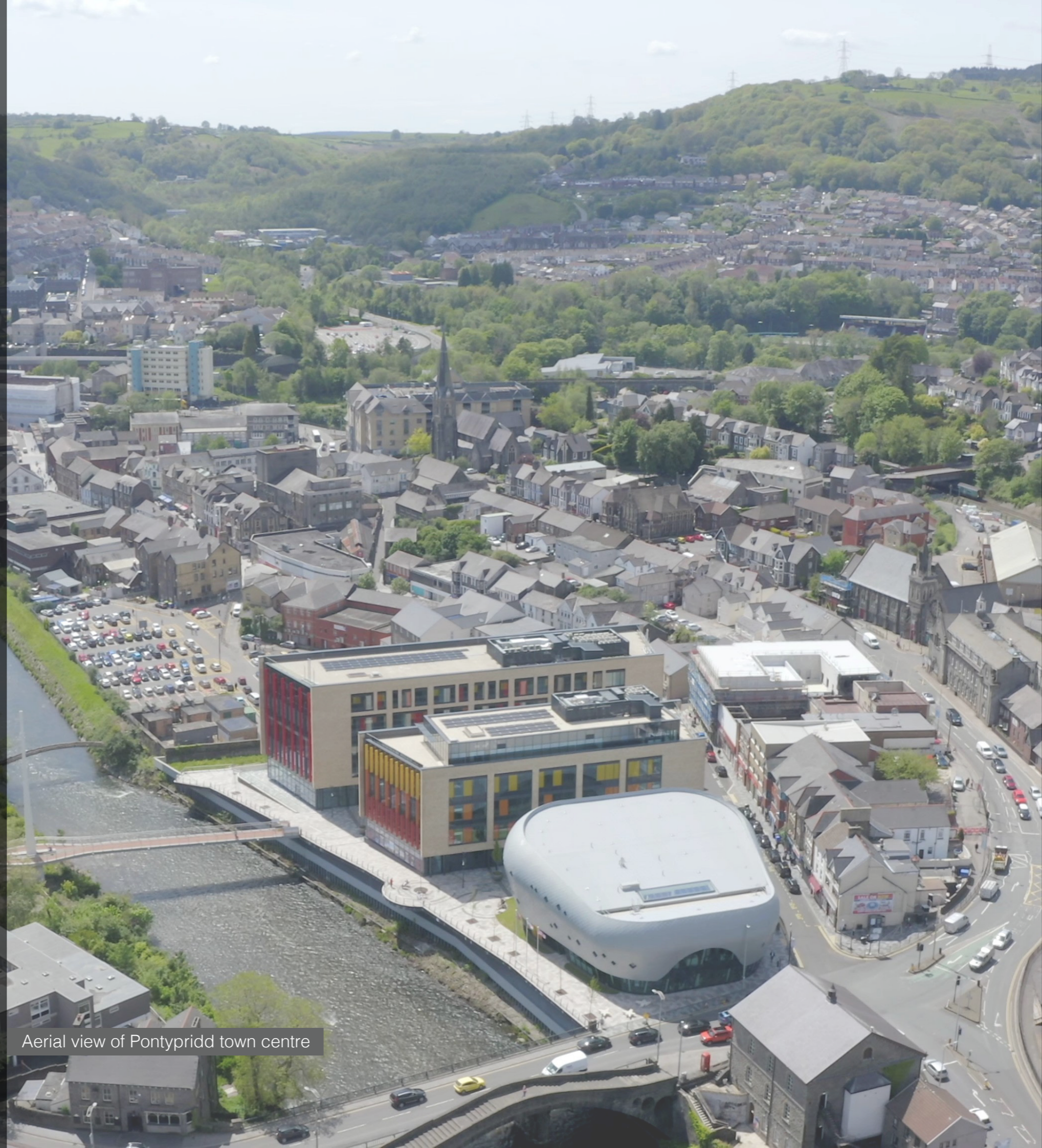
Aerial view of Pontypridd town centre

The Southern Gateway area presents a strategic opportunity to start delivering the Placemaking Plan on a major scale, creating significant momentum that can continue the town's significant growth.