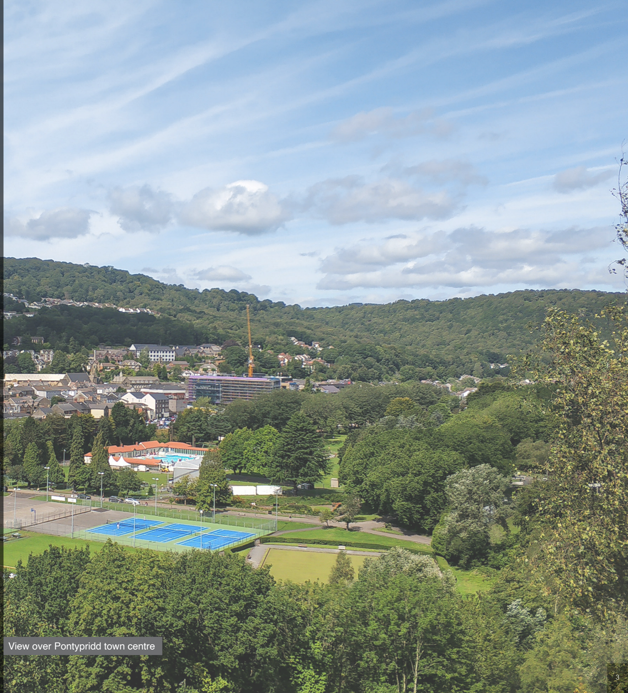
View over Pontypridd town centre

The Southern Gateway is the first area that people experience when entering the town from the south, including from Pontypridd Railway Station, which is a key station in the South Wales Metro. Transforming the area therefore provides the opportunity to create a distinct sense of arrival that is unique to Pontypridd; an opportunity to welcome people into the town; enhance its fine historic townscape; and open the town to its riverside and parkland setting.